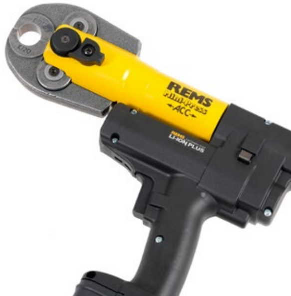
Battery Crimping Tool