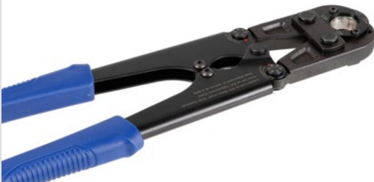
Manual Crimping Tool