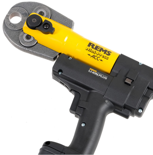
Battery Crimping Tool